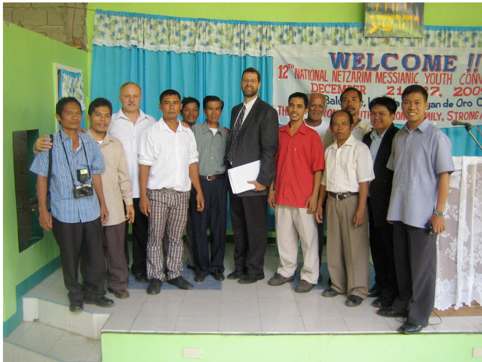
Picture with some Elders during the yearly Elder meeting and youth conference Dec 09